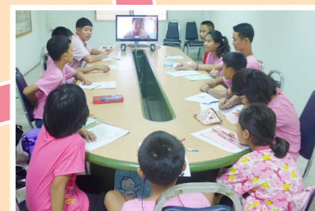
English via Skype